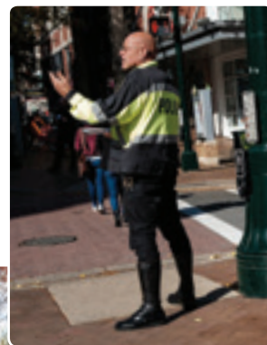
Montgomery County Police Department