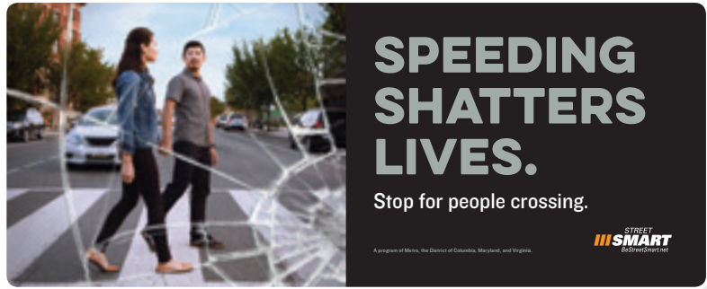
One of four ads presented to measure aided awareness