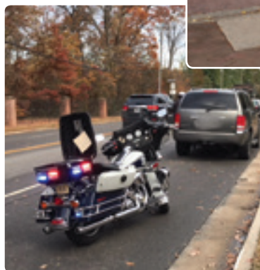
Alexandria Police Department