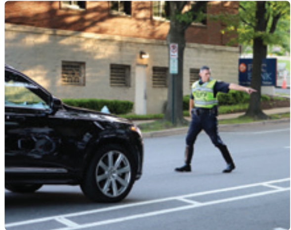
Arlington Police Department