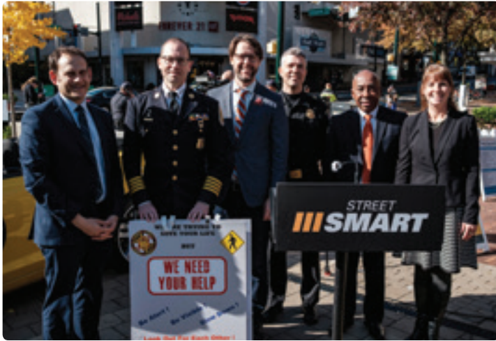
Fall Kickoff Speakers