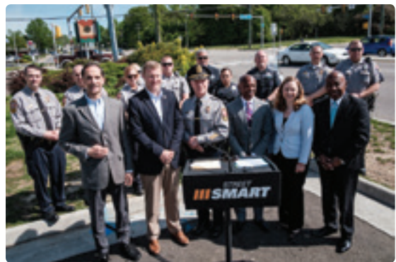
Spring Kickoff Speakers with Law Enforcement