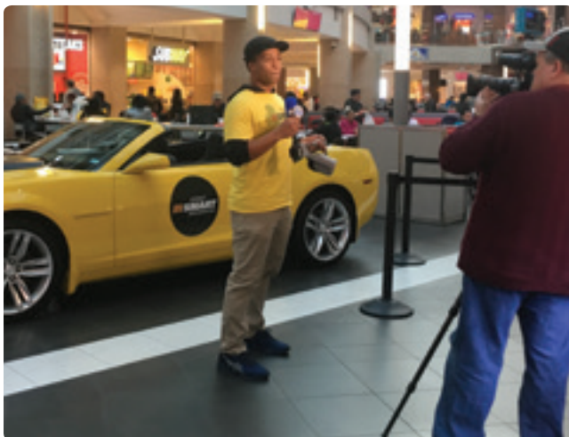
Street Smart Virtual Reality Challenge

In 2018, Street Smart developed an innovative new approach to on-the-ground outreach with the Street Smart Virtual Reality Challenge, an eye-catching and interactive educational exhibit.